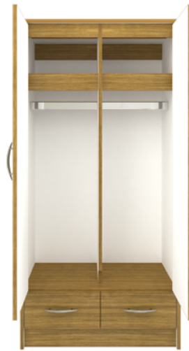
Model: ATALZ 34.75W 23D 71H

Kwalu's Atlanta Dementia/Alzheimers Wardrobes are thoughtfully designed to support resident independence and safety. Light colored interiors help with spatial orientation. Features include softly rounded edges and waterfall detailing. Hidden door latches and passive locks allow caregivers exclusive access. Choose from dozens of hardware styles, including ADA-compliant. The product is required to be wall mounted for safety. Using the kit provided, please follow provided instructions exactly.